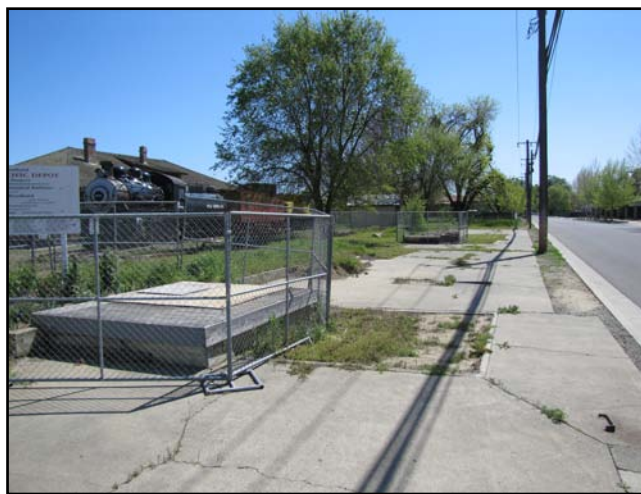
Granary foundations bordering 6 th Street, 2011. Note steam locomotive 1233 in background