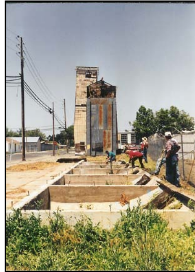
Granary foundations, 1995